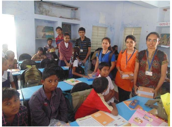
GIT Students Team