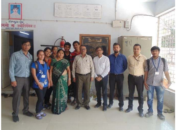
School and GIT staff Members