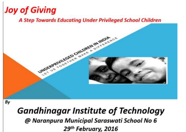
Banner of Noble Cause