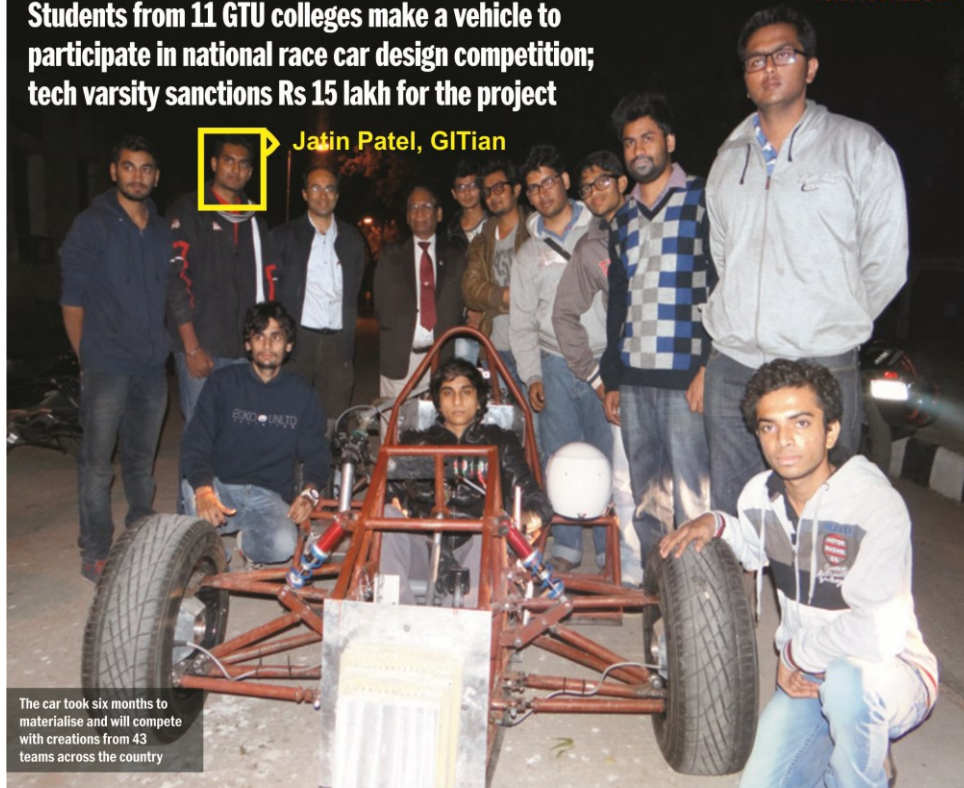
The car took six months to materialise and will compete with creations from 43 teams across the country