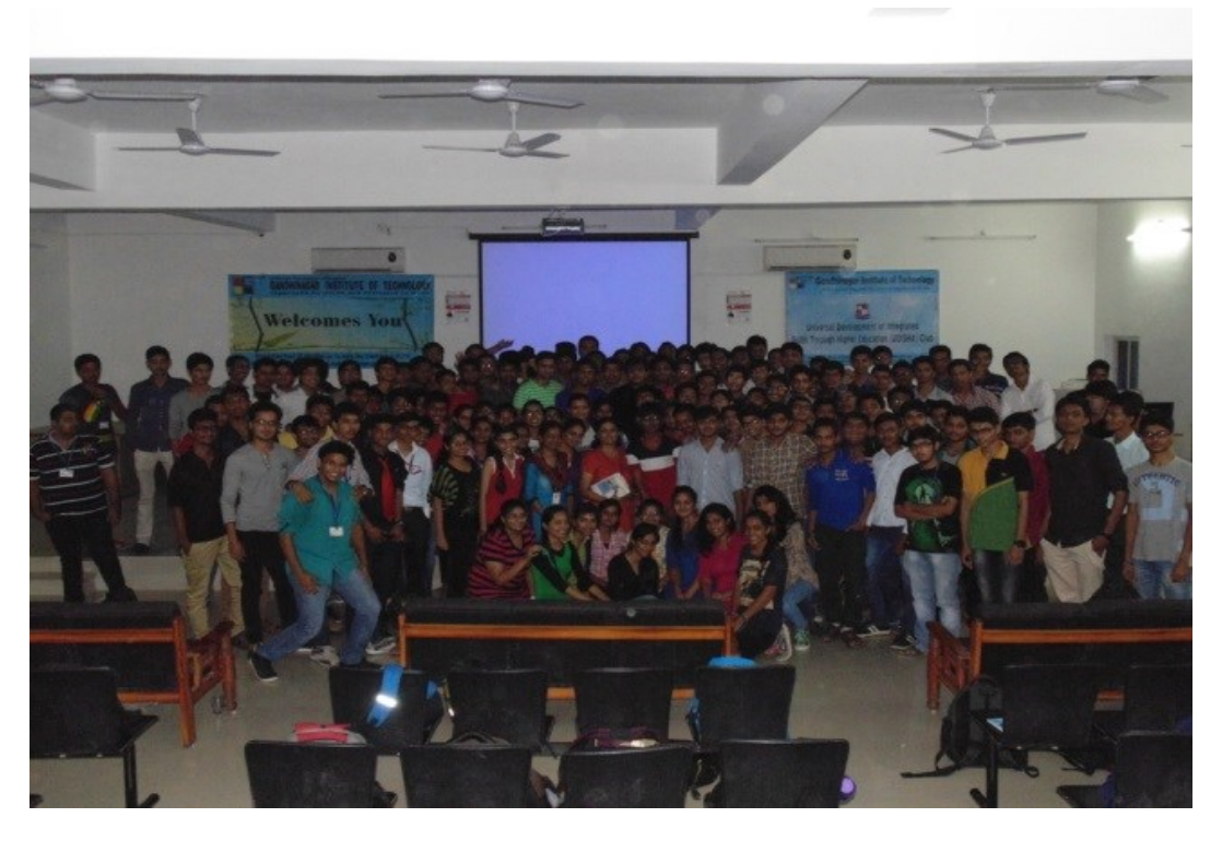
Group photo of participants, co-ordinator and speaker of workshop at GIT premises