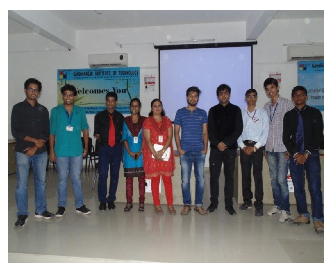
Faculty and Student Co-ordinators with Speaker