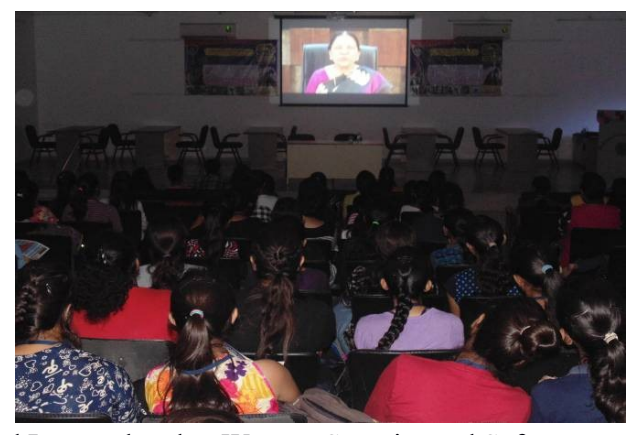
Video lectures were shown for Self Defense and Laws related to Women Security and Safety