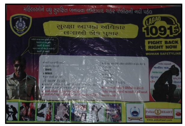
Halla Bol Season 2 Organized in ordinance with Wajra O Force Foundation, Anti Narcotics Bureau and Ahmedabad Police Department