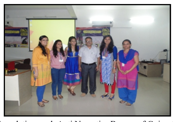
A token of appreciation from Wajra O Force Foundation and Anti Narcotics Bureau of Gujarat Government to GIT