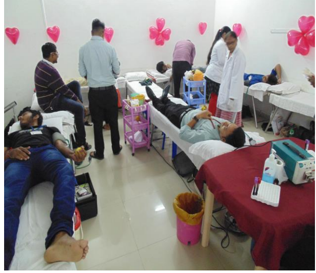
Students donating blood in the drive