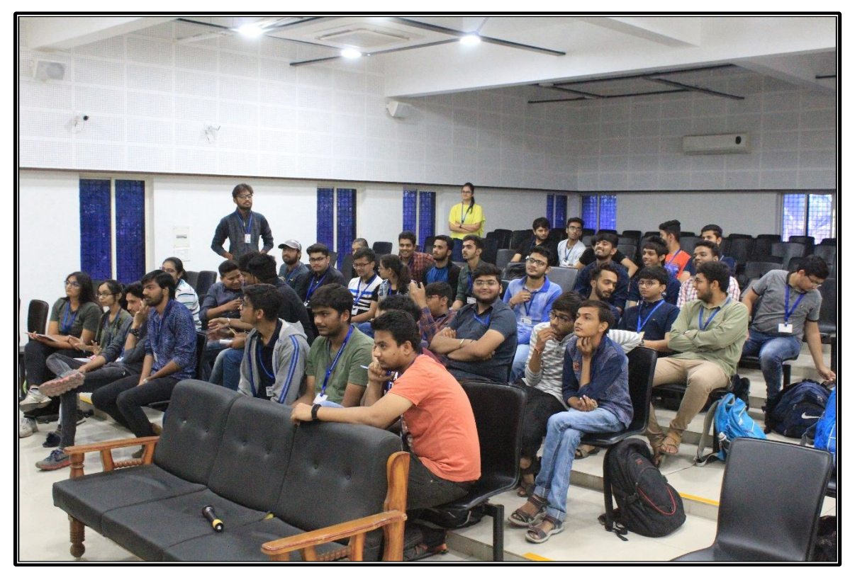
Information session going on