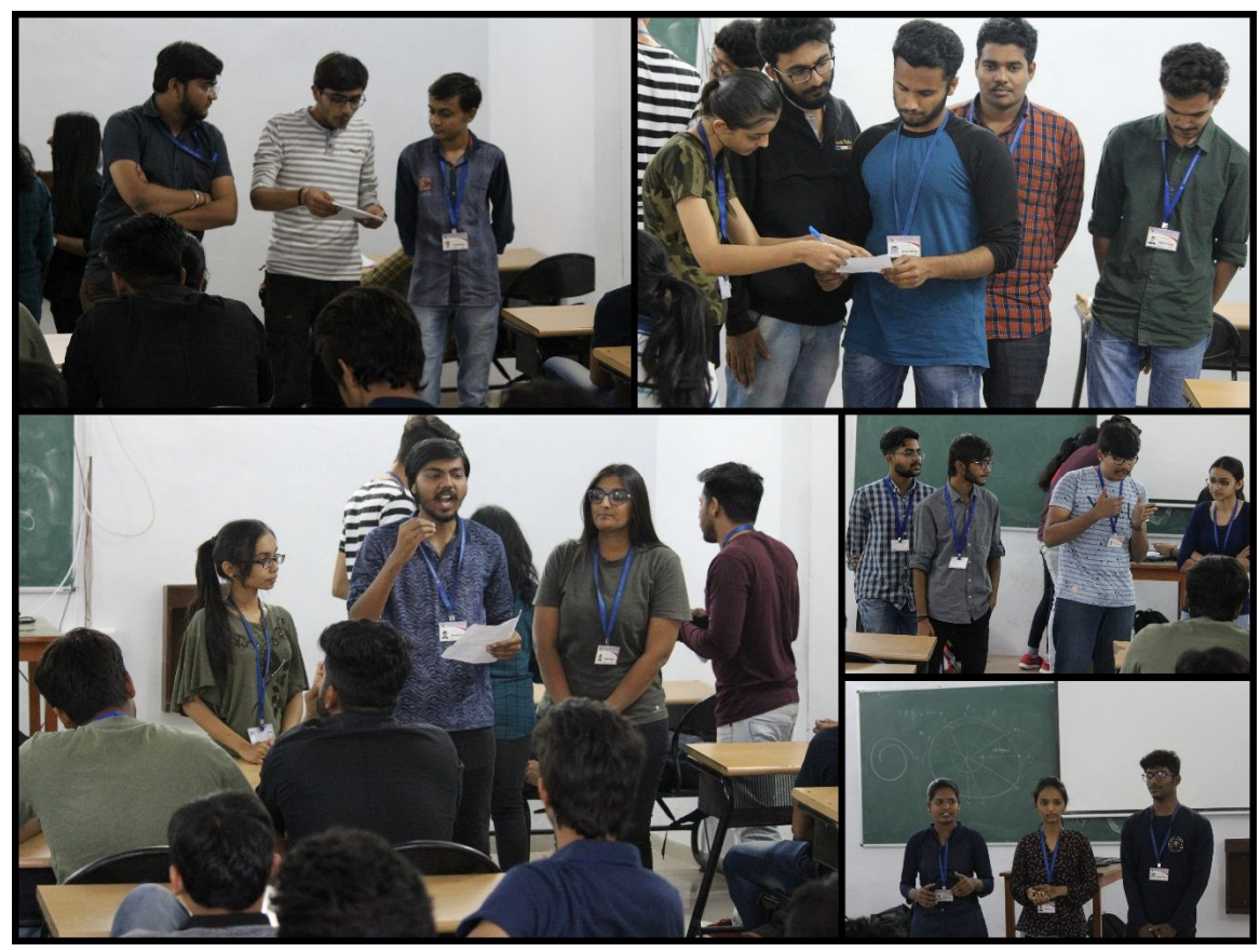
Participants presenting their ideation