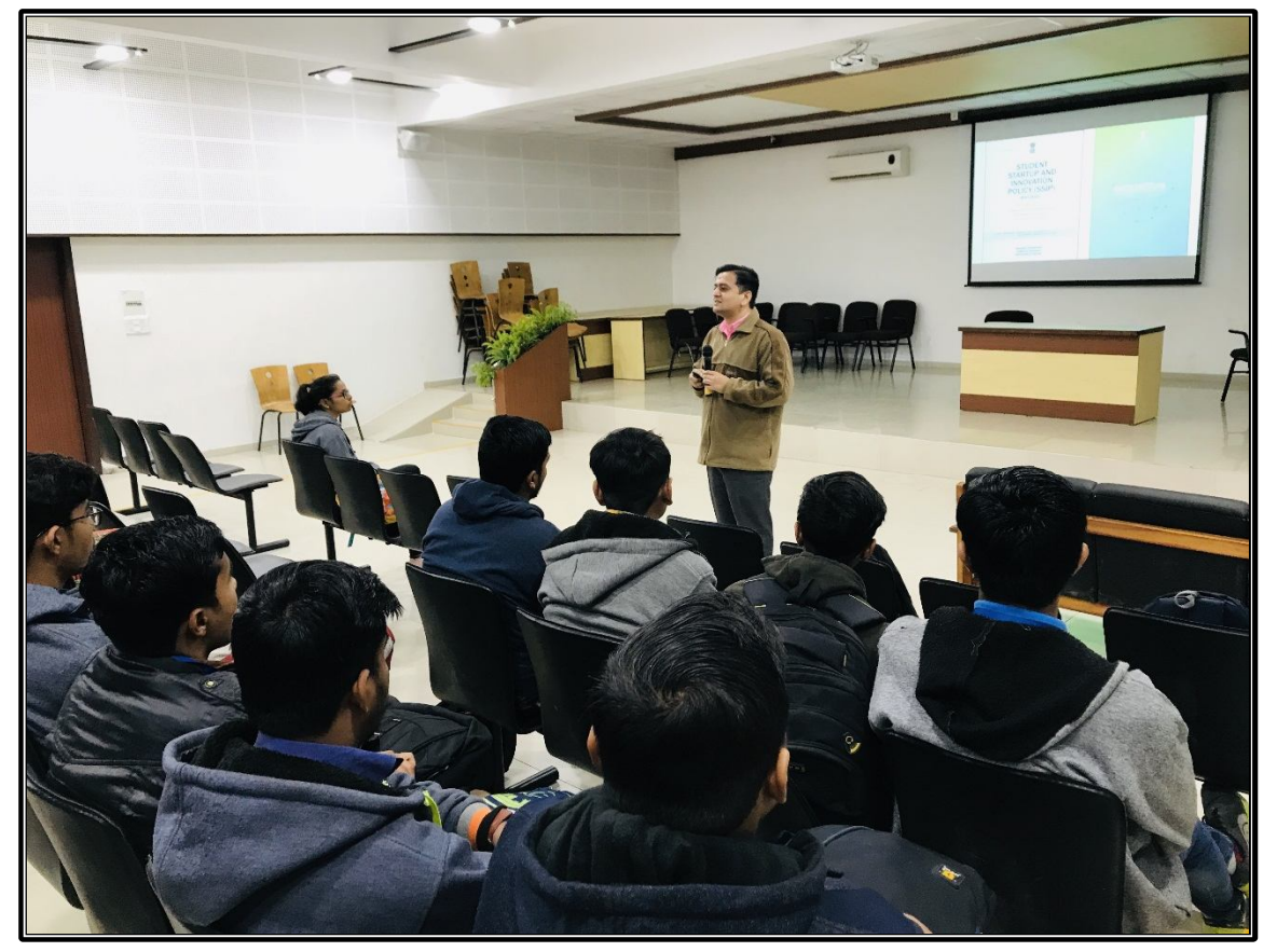
Mentor educating participants