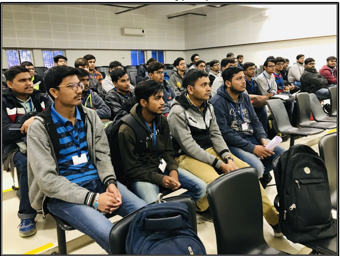
Participants listening mentor