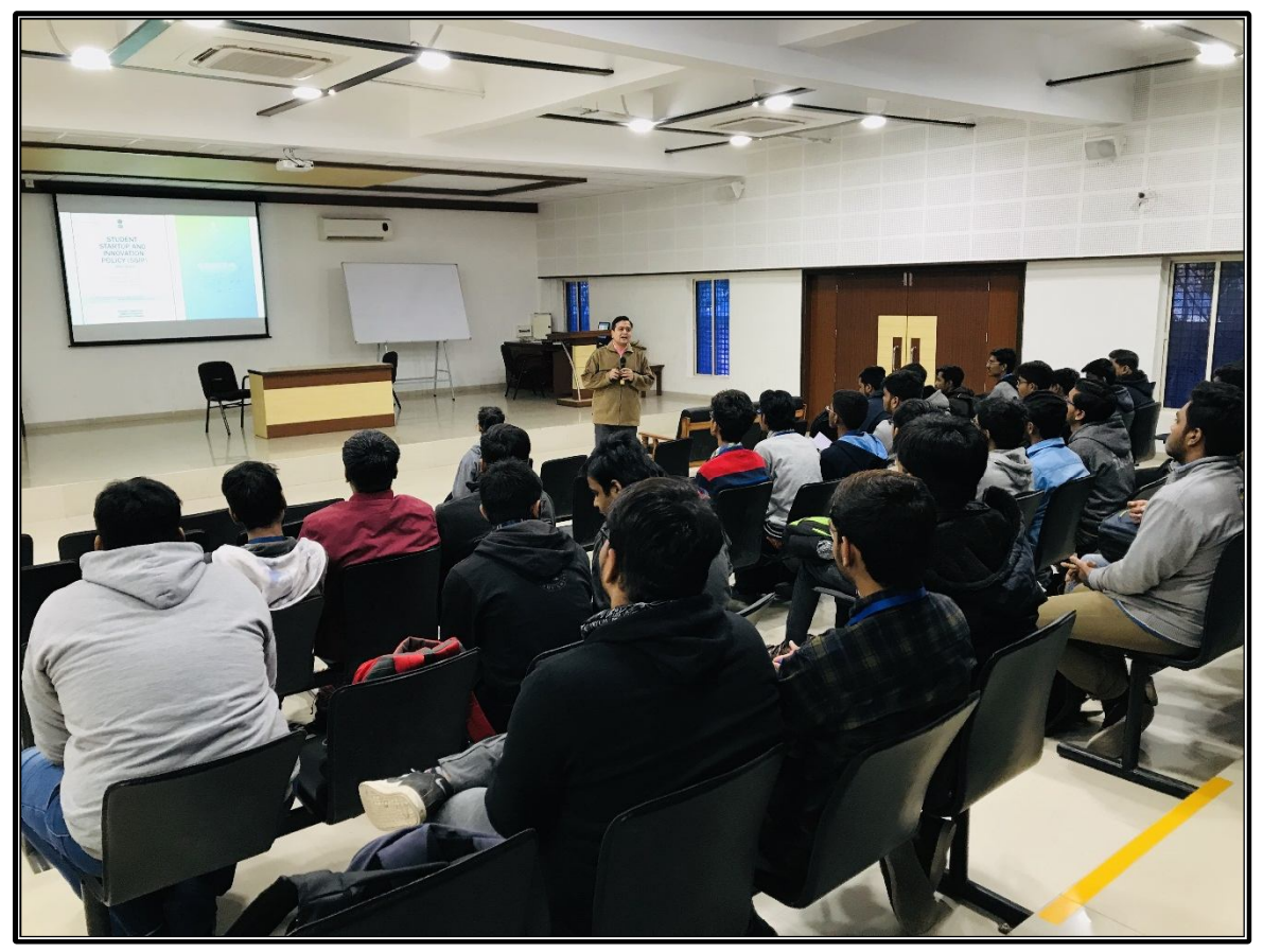
Mentor discussing about SSIP & IPR Policy