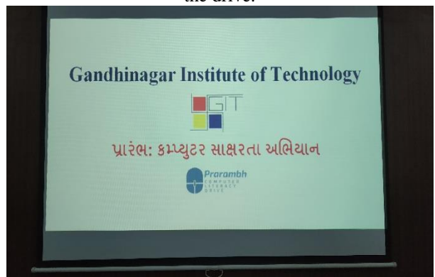
Presentation of 'Prarambh - Computer Literacy Drive'