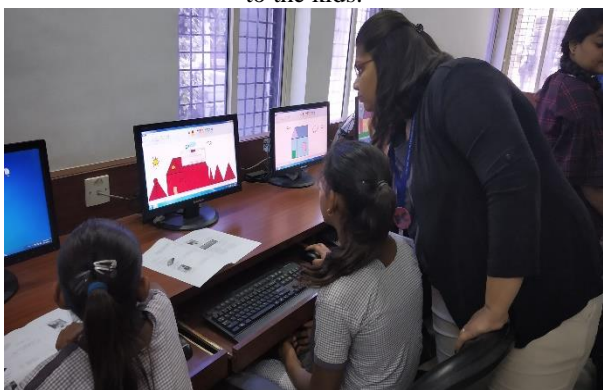
Student Volunteer clearing doubts of students about MS Paint.