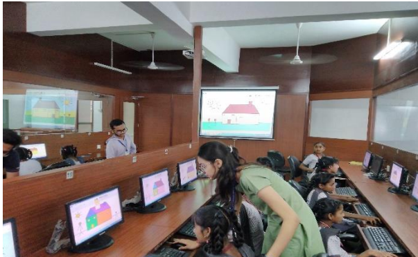
Faculty Volunteer explaining basic computer hardware to the kids.