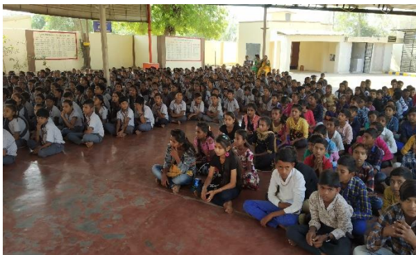
Kids of 'Moti-Bhojan Pay Center School-1' during 'Certificate Distribution Ceremony'.