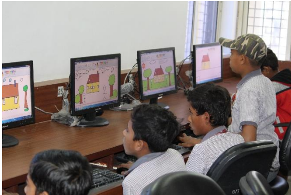
Kids practicing their artistic skills in MS Paint.