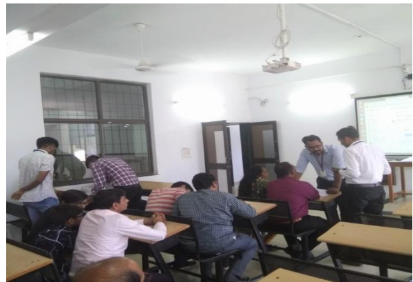
Mentor's discussion with parents