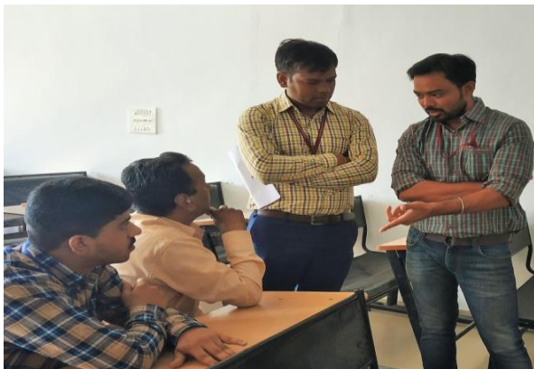
One to one interaction between faculties and parents