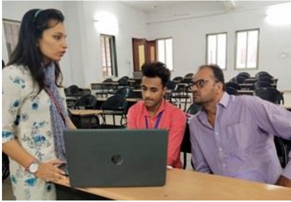
Parents were briefed about their wards' performance