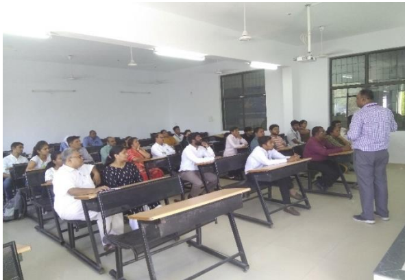
HOD explaining teaching learning process to parents