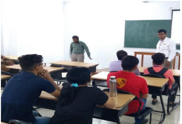
Parents are informed about rules and regulations of GIT and GTU