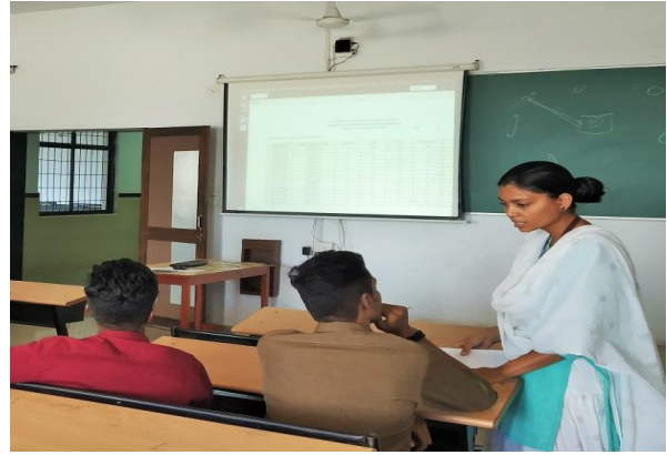
Faculties discussing GTU Examination results of the student with parents