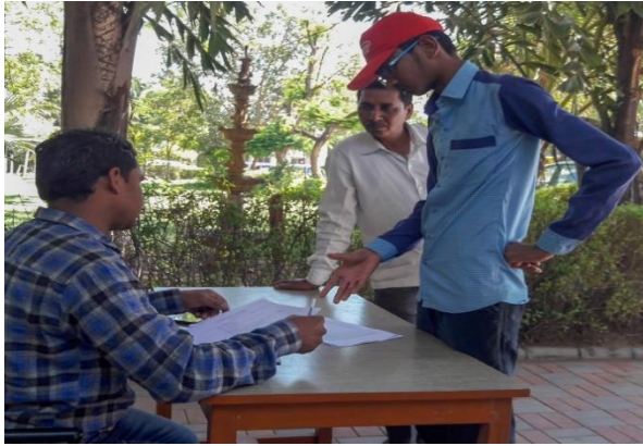
Welcome Desk for parents at GIT