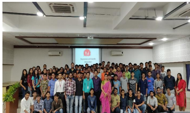
Group photo with 1 st Year engineering students and faculties