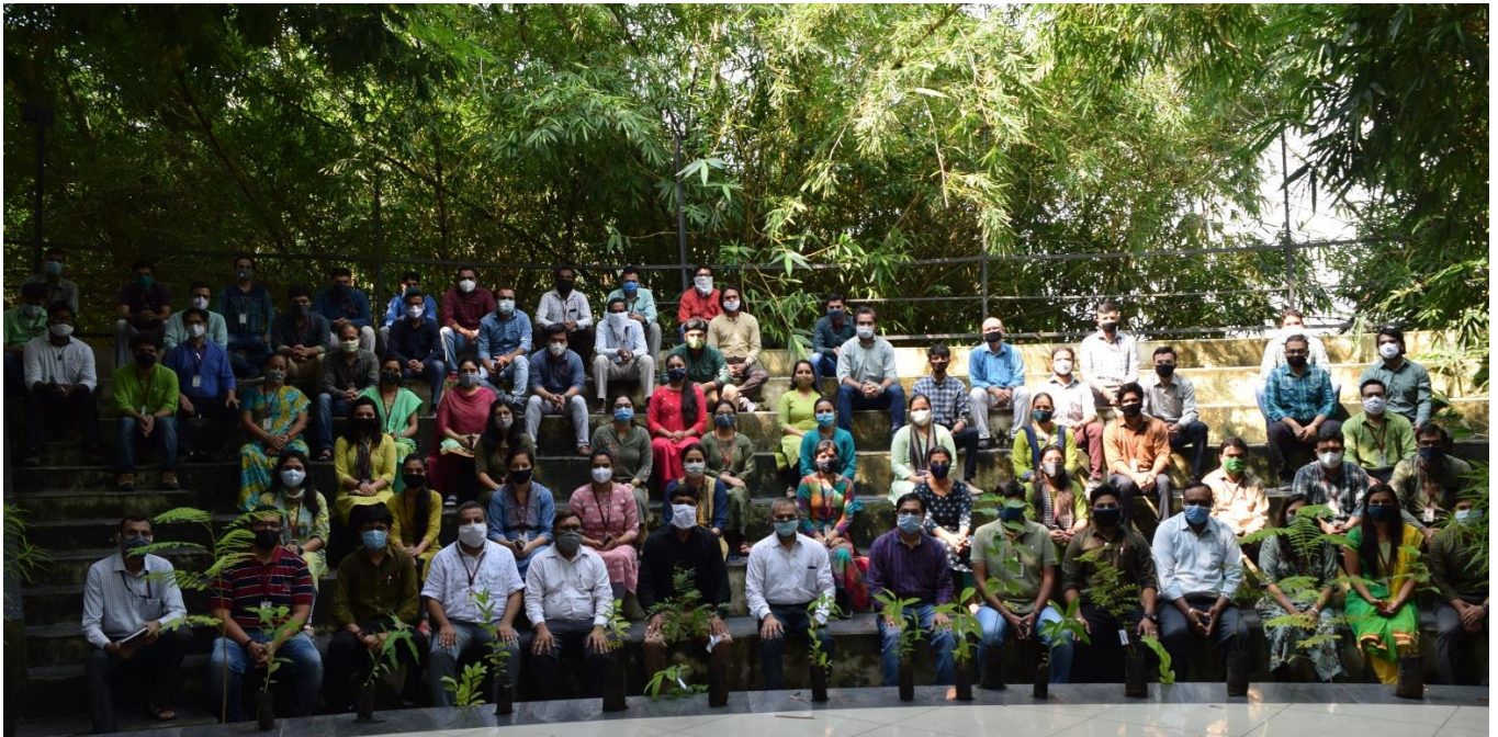
Team GIT at Amphitheatre for Tree plantation Event