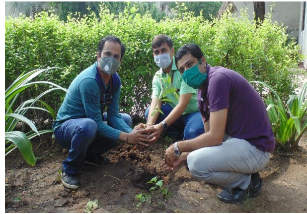
Plantation of Saplings by Faculties from various departments