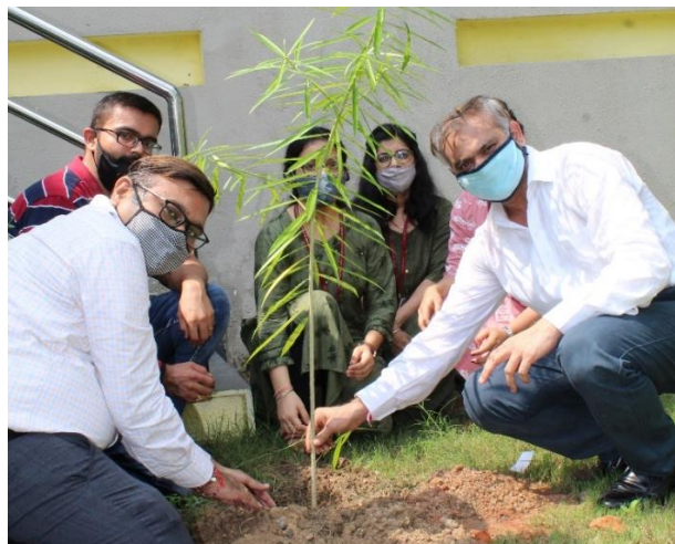
Tree Plantation by the Director