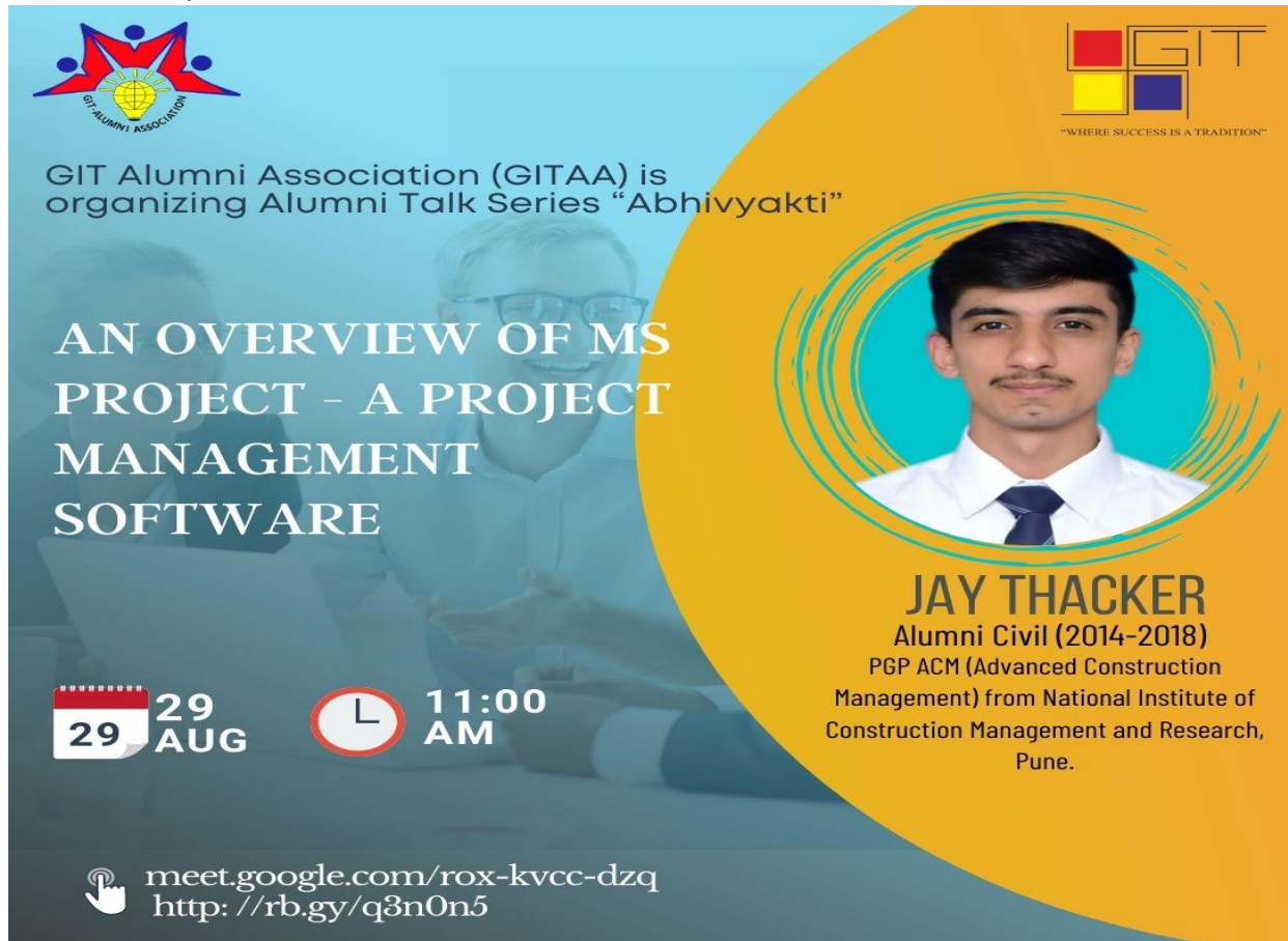
Social Media Creative of the webinar