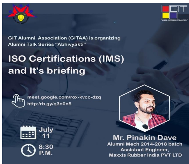
Social Media Creative of the webinar