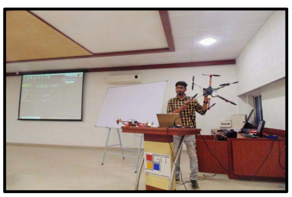
Alumni Expert describing a hexacopter