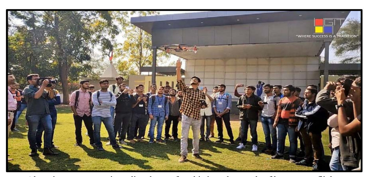
Alumni expert presenting a live demo of sophisticated controls of hexacopter flight