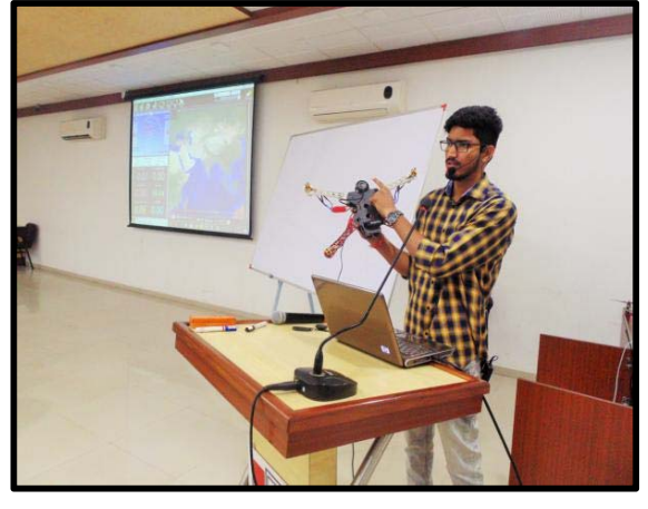
Alumni explaining the software simulation