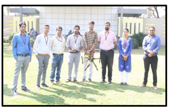
GITAA coordinator team with alumni expert