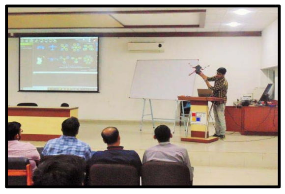
Alumni Expert describing a quadcopter