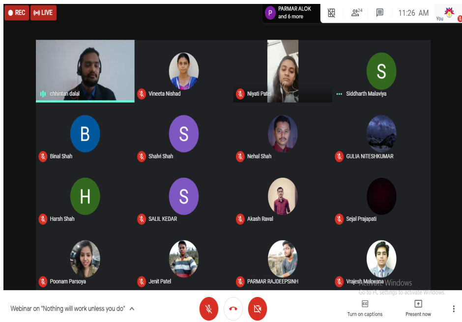
Alumni interacting with the audience and solving their queries