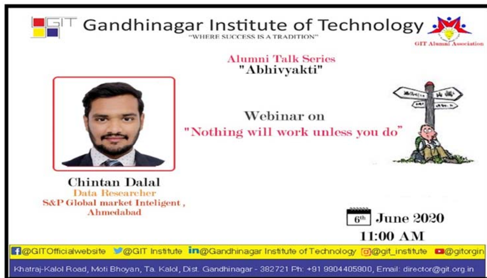
Social Media Creative of the webinar