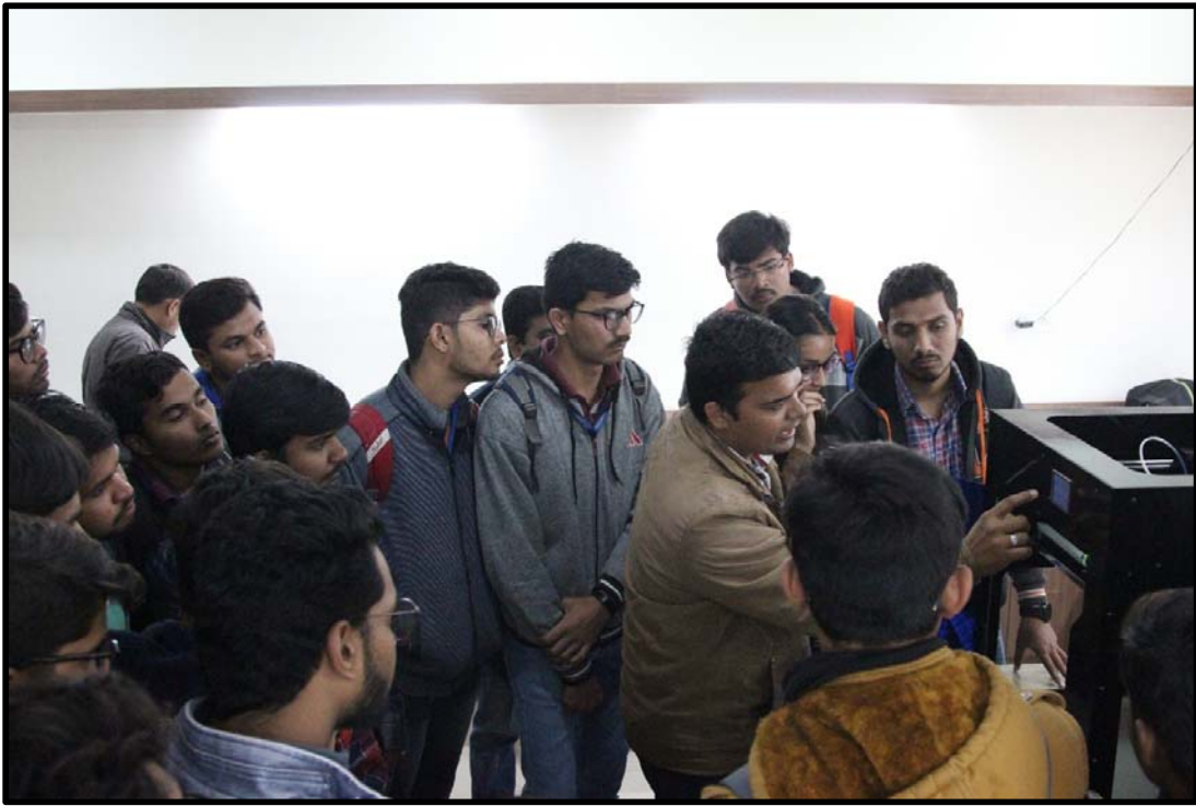
Hands on exercise on 3D printer