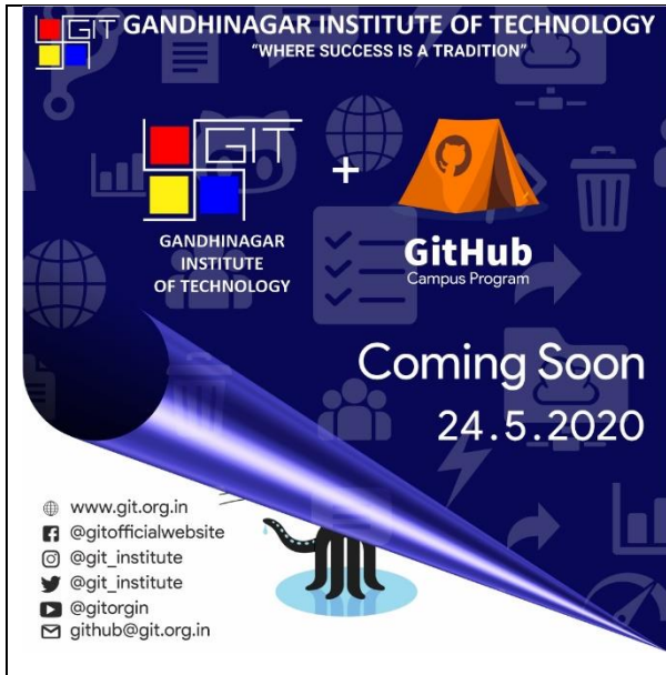
Creative for Launch of GIT-GitHub Club