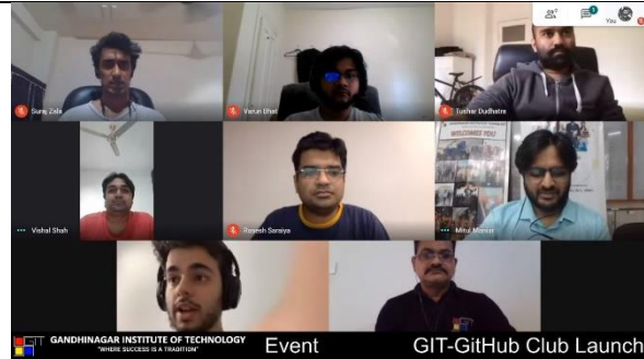
All attendees of the livestream