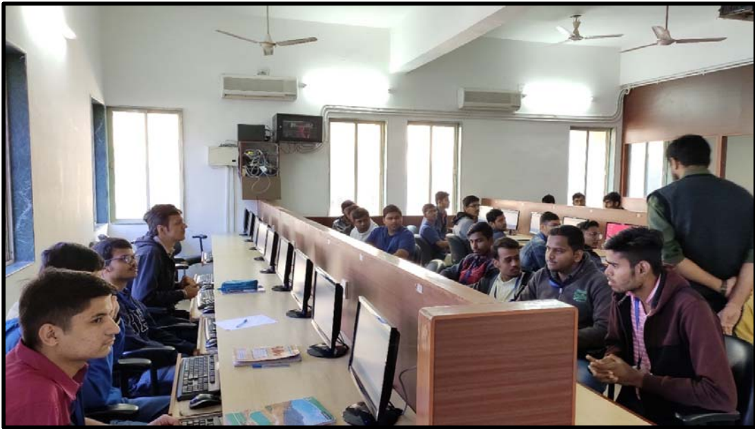
Expert addressing queries;