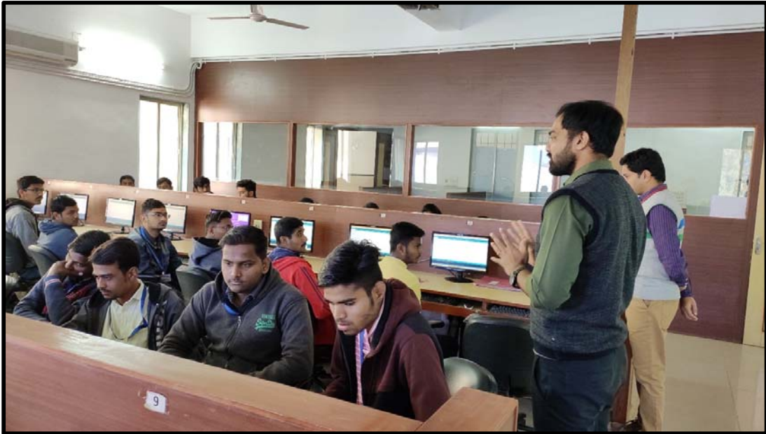
Mentor delivering session