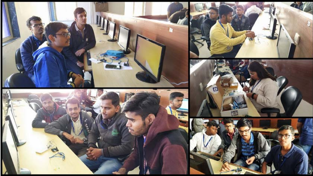
Participants preparing aurdino project;