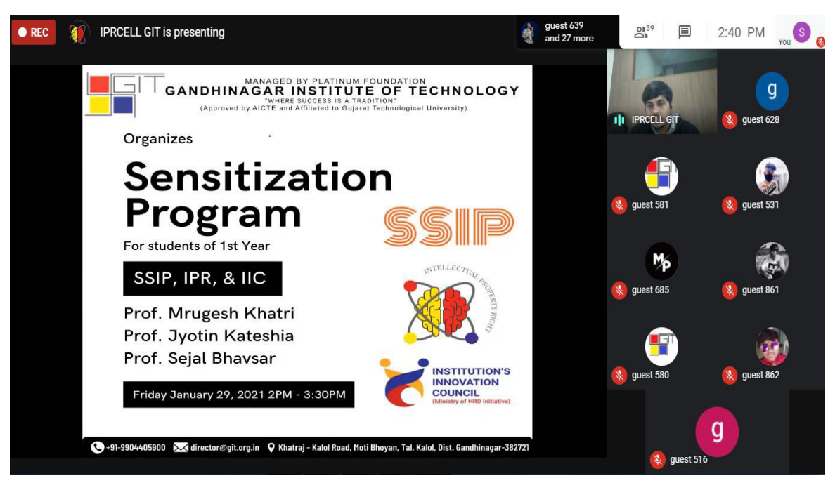
Initiation of the webinar