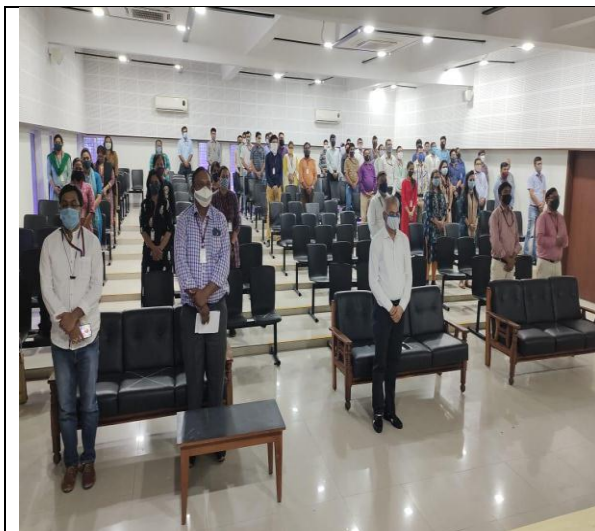
A Picture of Inaugural Function