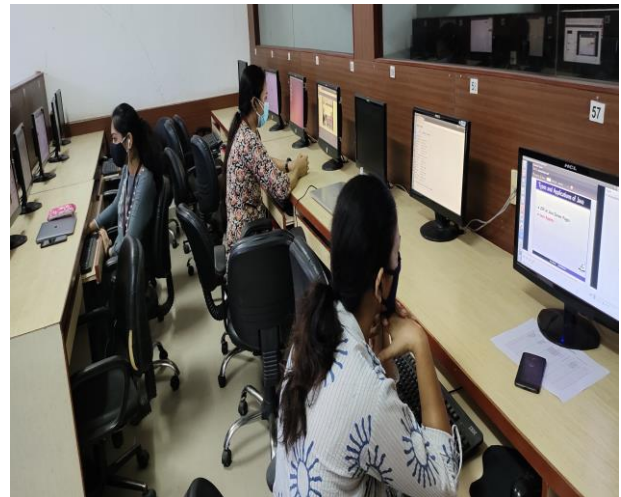
Faculty attending JAVA workshop, Winter 2021