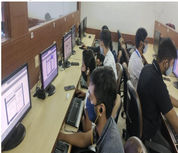
Students attending JAVA workshop, Winter 2021