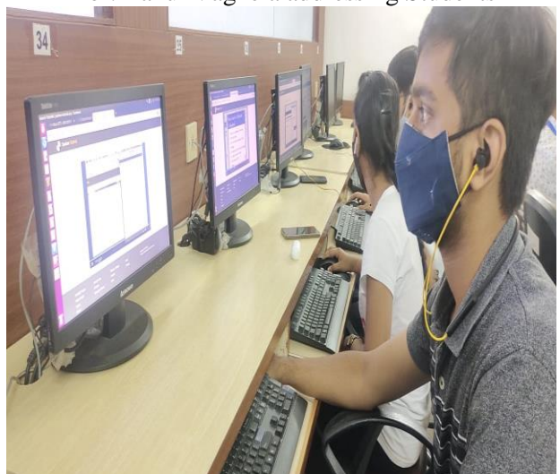
Attending JAVA workshop, Winter 2021