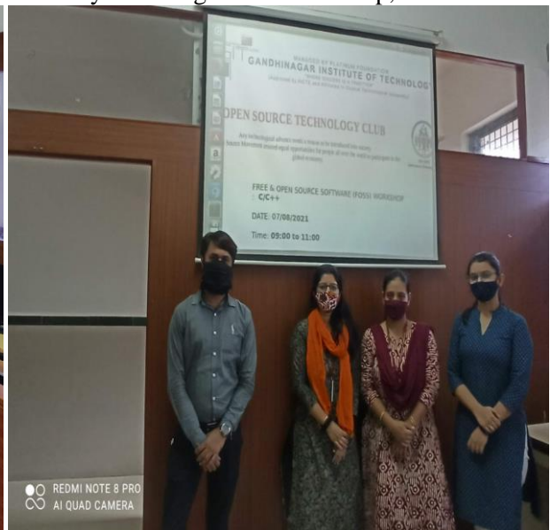
Faculty group photo, C & C++ workshop