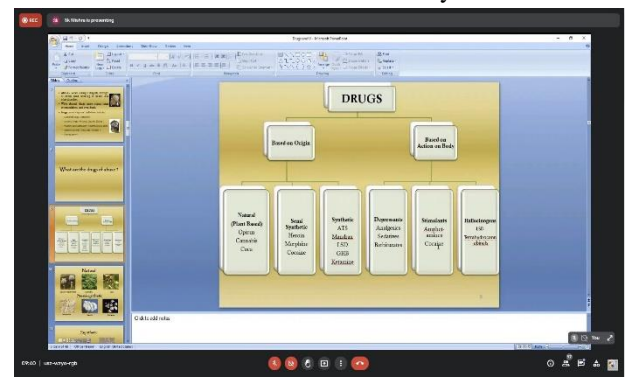
The speaker explaining different types of drugs