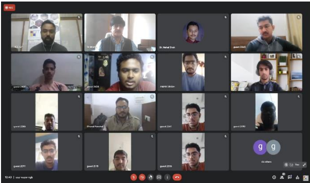
Group photo of speaker and HCC members with 1^{\rm st} year engineering students