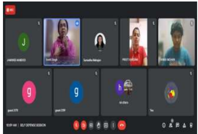
Introduction by trainers