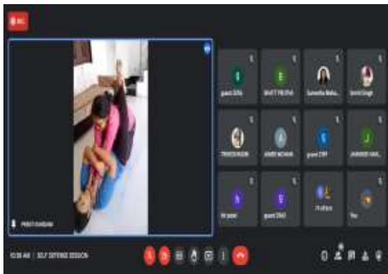
Participants learning Self defense Techniques