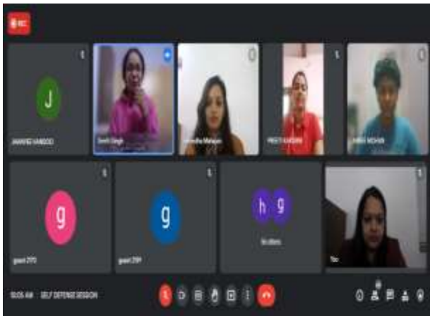
Beginning of the Session