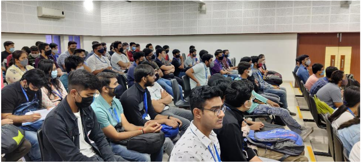
Students Listening lecture with interest