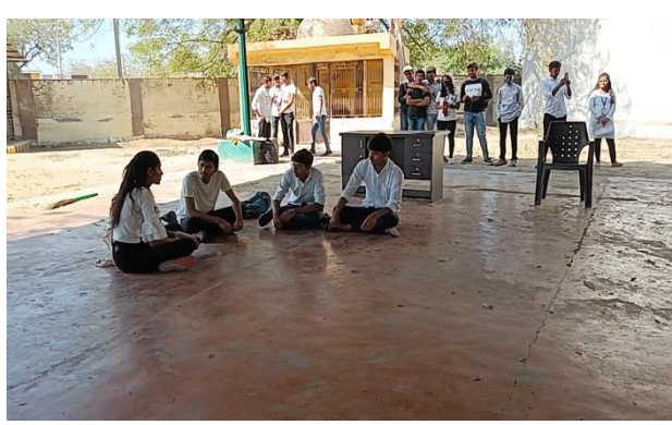
Student Volunteers performing a short skit on Anti-Tobacco awareness