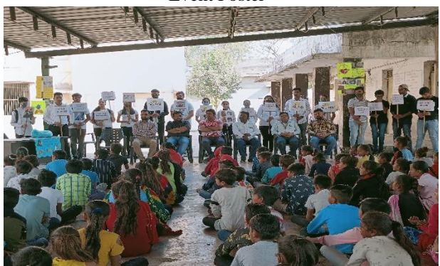
Dignitaries of the event with student volunteers and school students