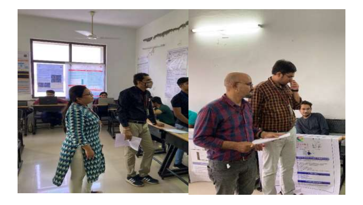
Mechanical Engineering Department