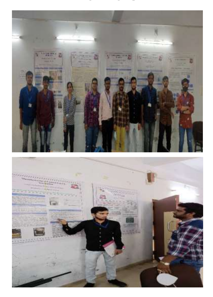
Electronics & Communication Engineering Department