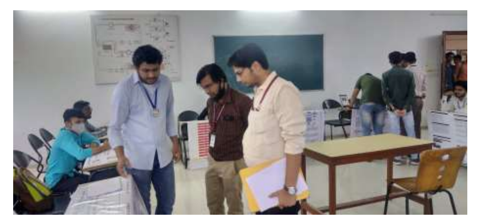
Civil Engineering Department