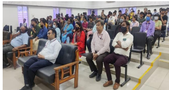
Participants attending the talk