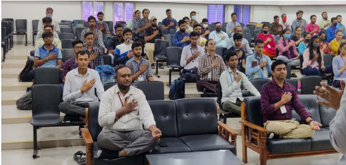
Experience of Meditation exercises by participants