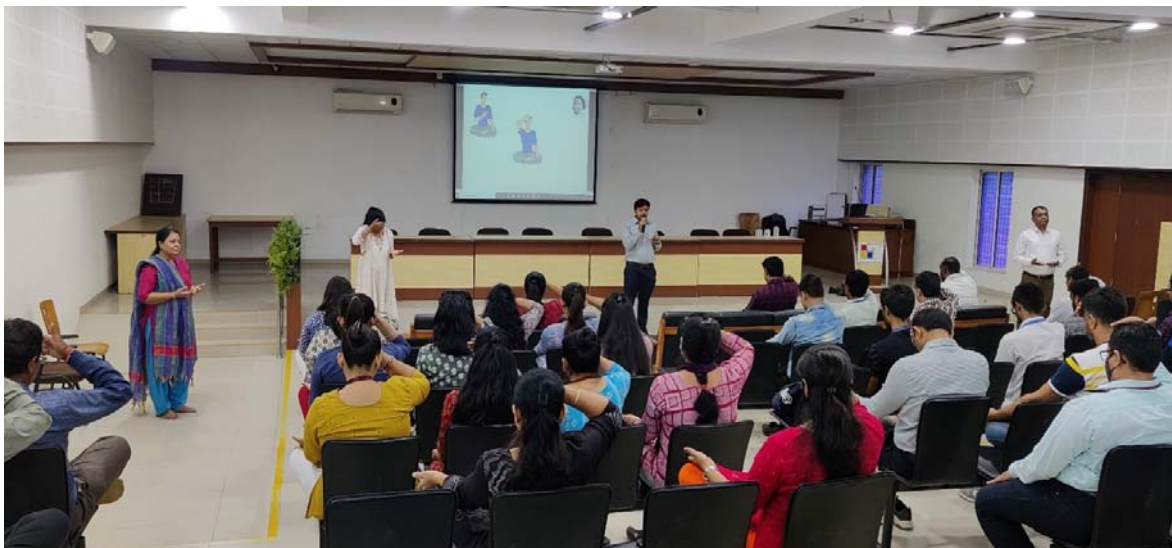
Meditation performance by all participants