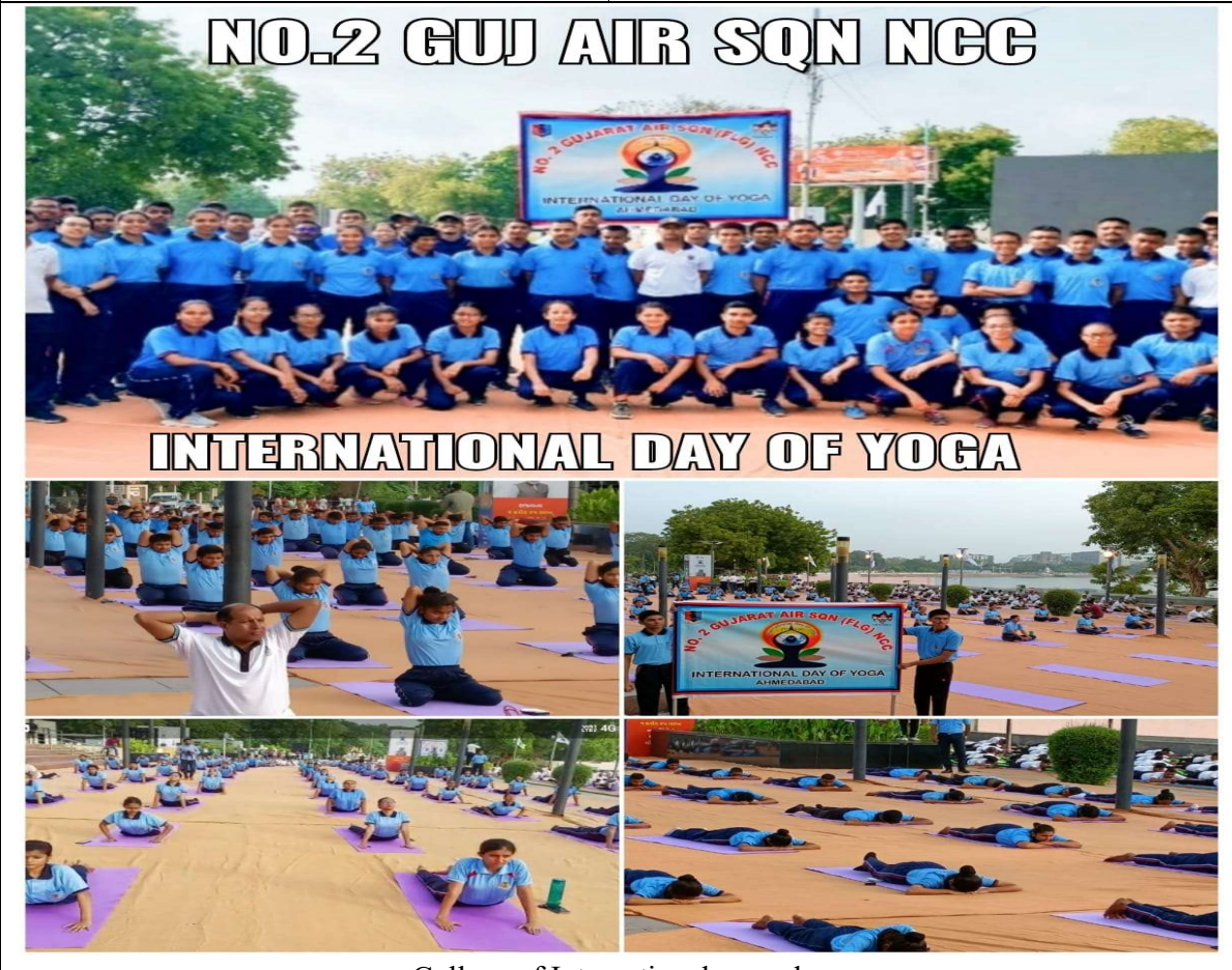
Collage of International yoga day