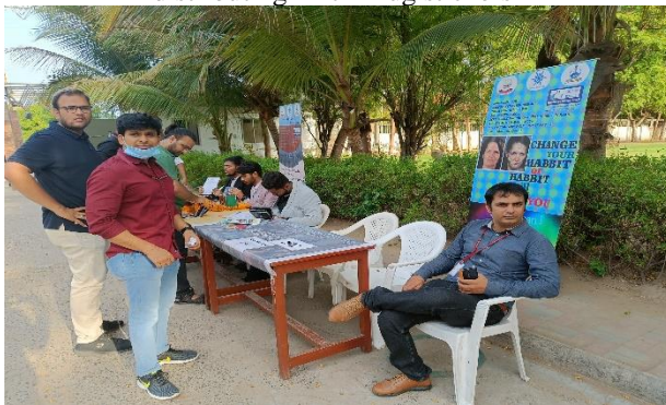
HCC spreading awareness during "Farewell Party of 2018 Batch"