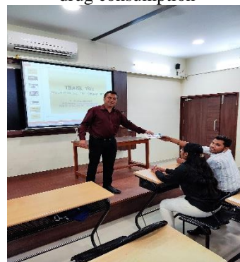
Speaker distributing pamphlets to 2 nd Sem. MBA students