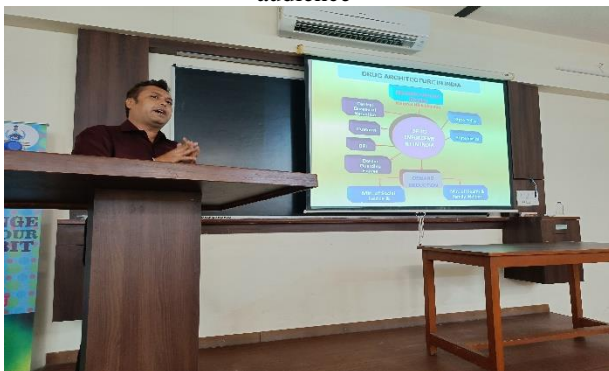
The speaker explaining the demand reduction side of drug consumption