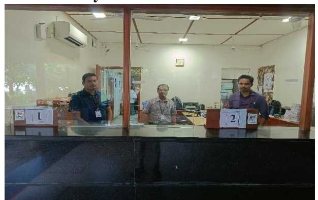
HCC spreading awareness in Admin Department by distributing Anti-Drug stickers