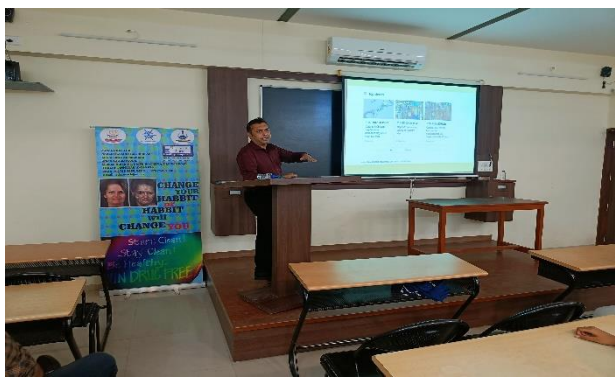
The speaker explaining the reason behind the growing drug consumption