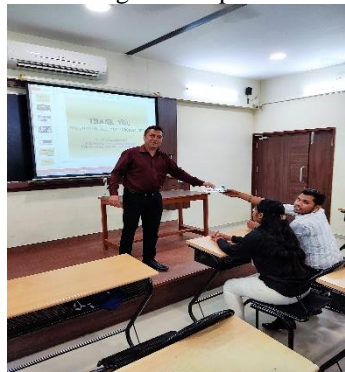
Speaker distributing pamphlets to 2<sup>nd</sup> Sem. MBA students