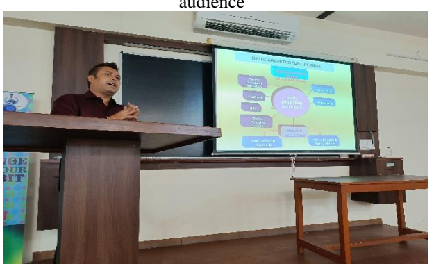
The speaker explaining the demand reduction side of drug consumption