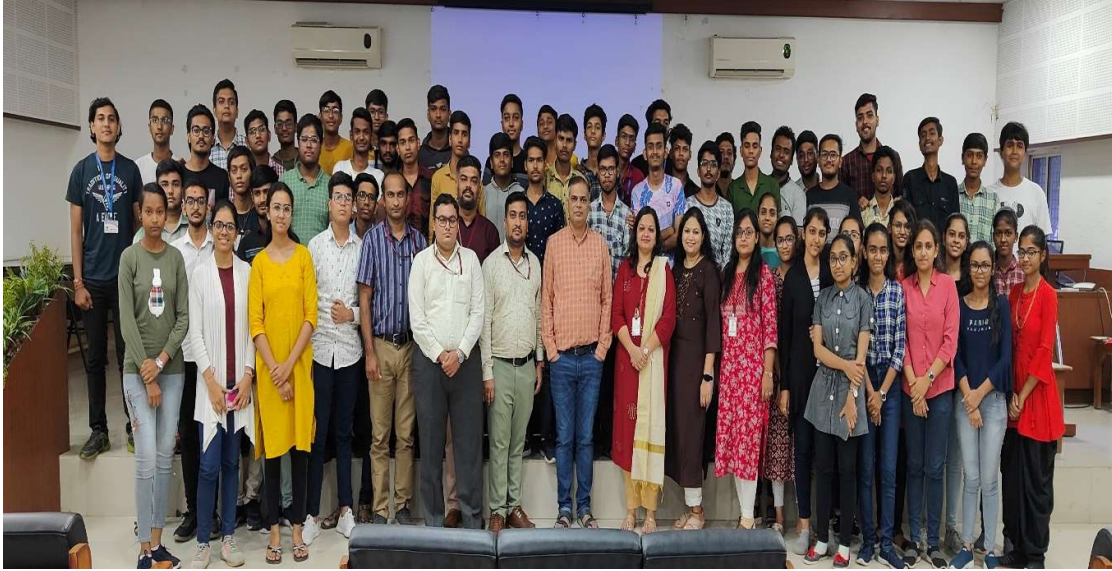
Group Photo with present Dignitaries