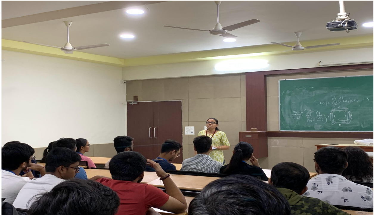
Introduction and Welcome of Expert