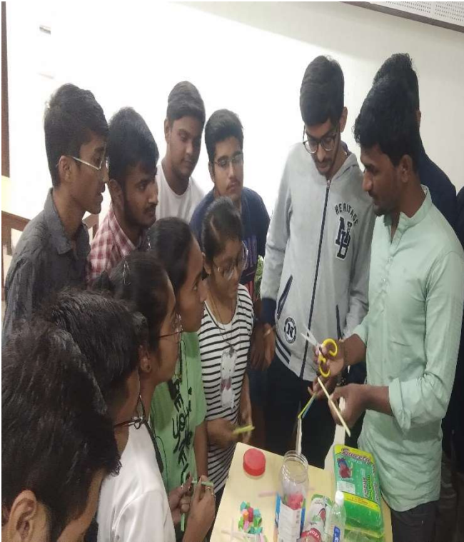
Creative Learning Session