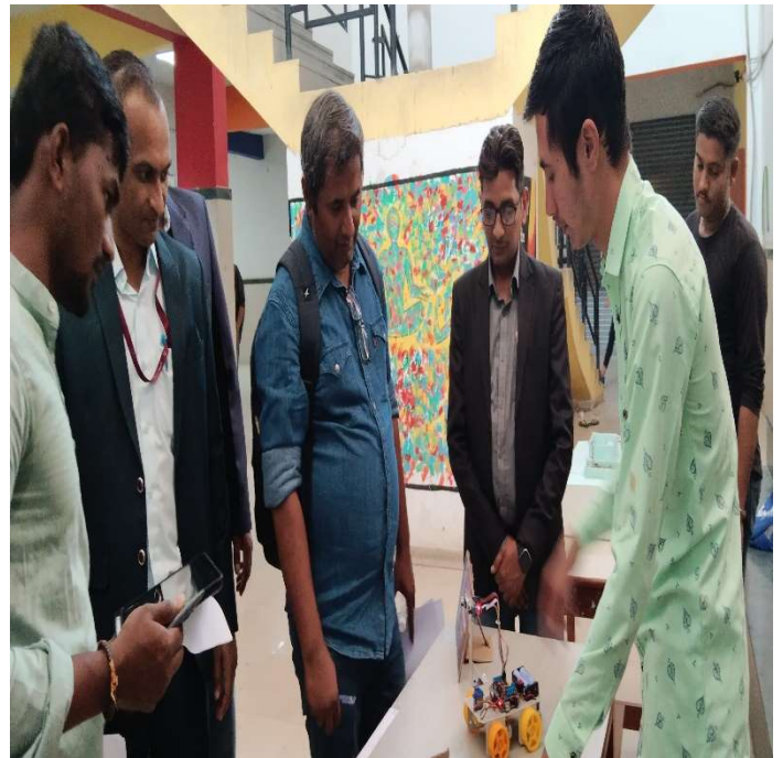
Students Project Presentation