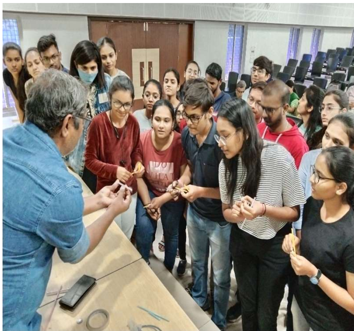
Activity Performed by Participants