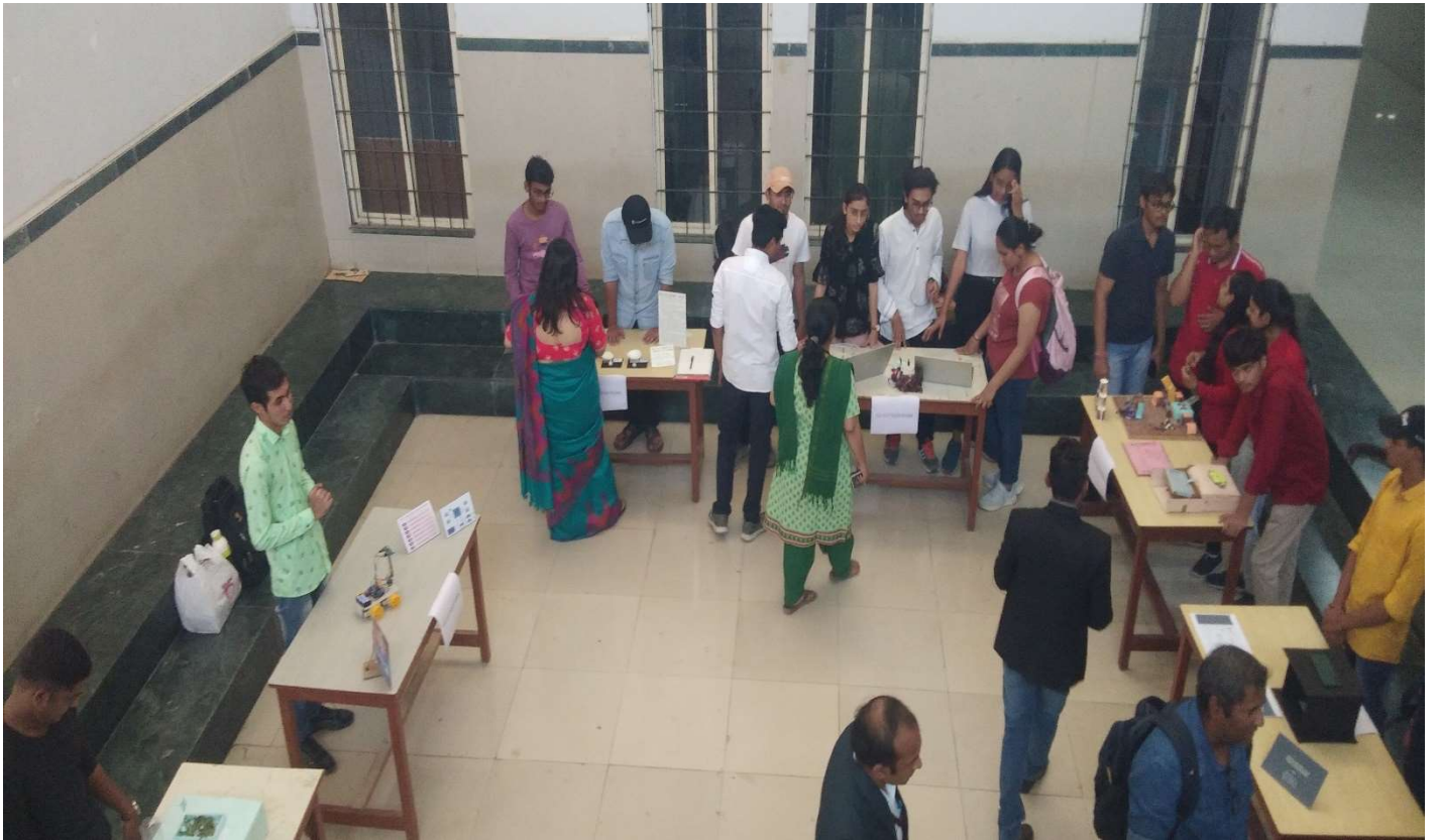
Project Demonstration Session