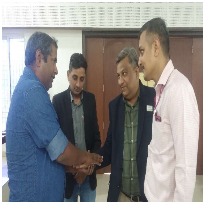
Activity Performed by Faculties