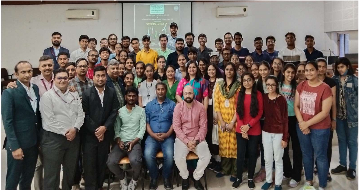
Group Photo with Experts and Participants