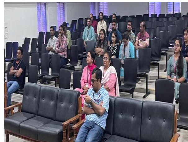
Participants attending the session