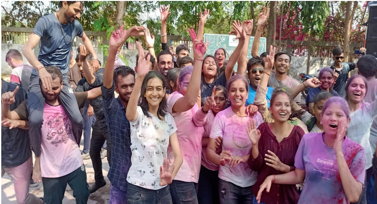
Students Celebrate Holi with colour