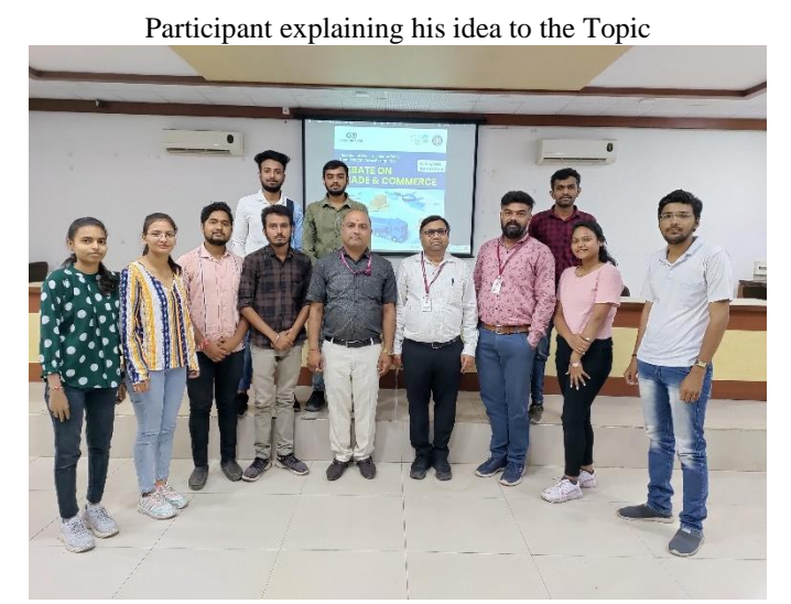
A Group Photo of the Competition