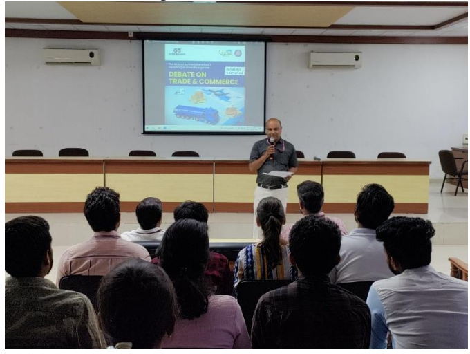
Coordinator explaining the theme of Trade and Commerce