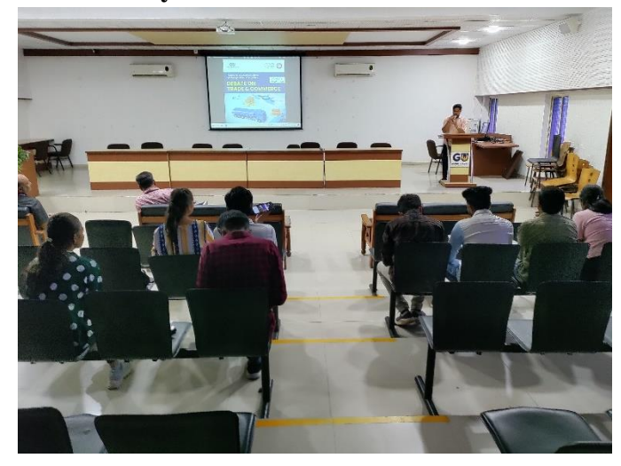
Debate Competition on Trade and Commerce